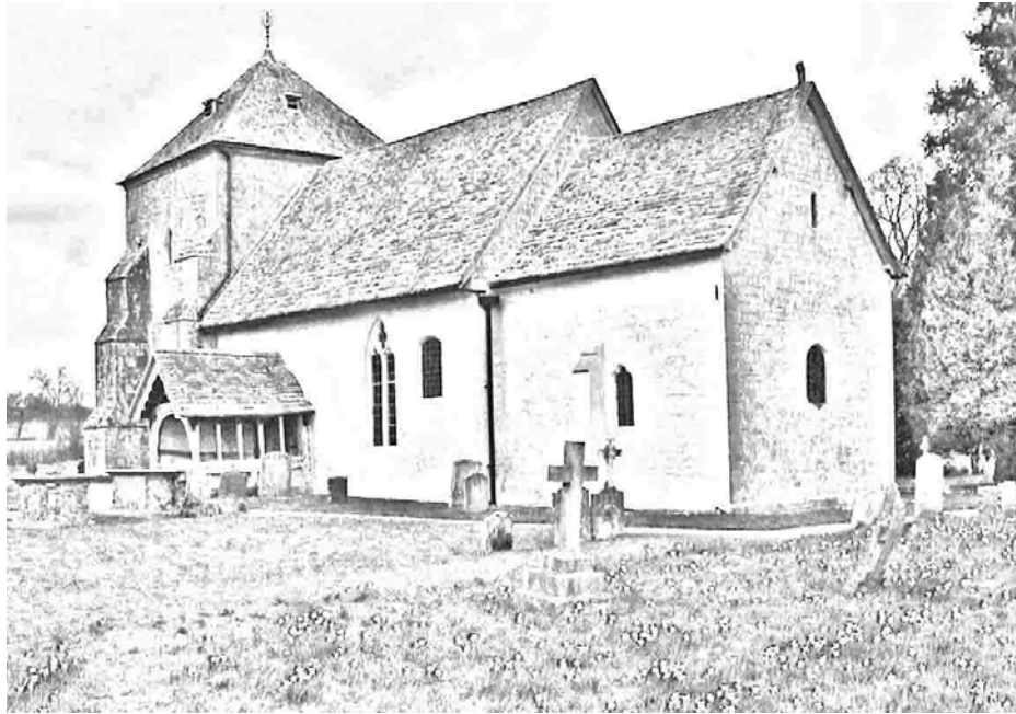
St Mary's Church, Kempley (ca 1120)